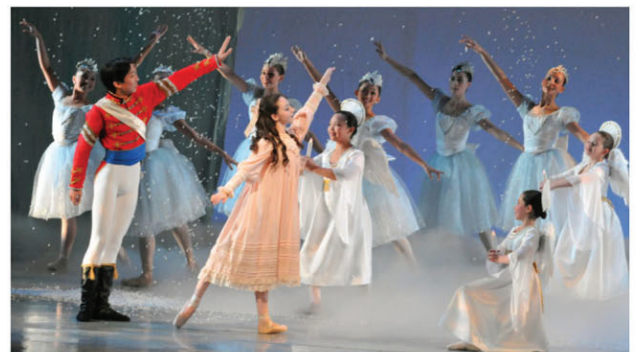
from Nutcracker