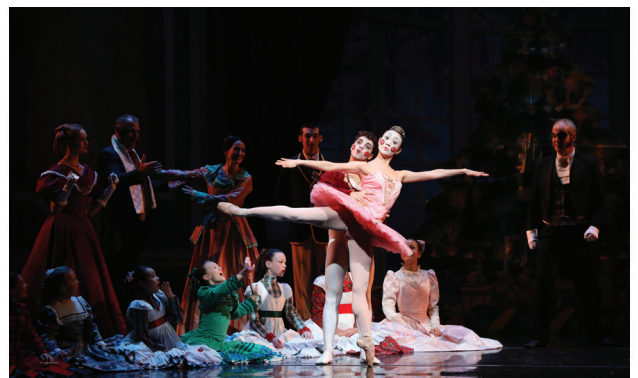
from Nutcracker