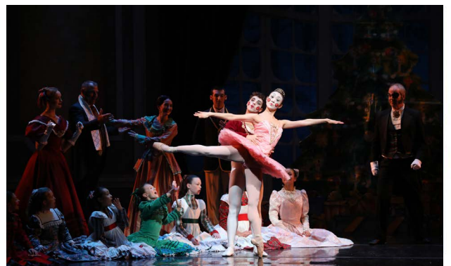
from Nutcracker