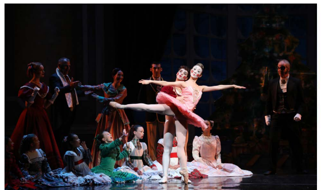
from Nutcracker