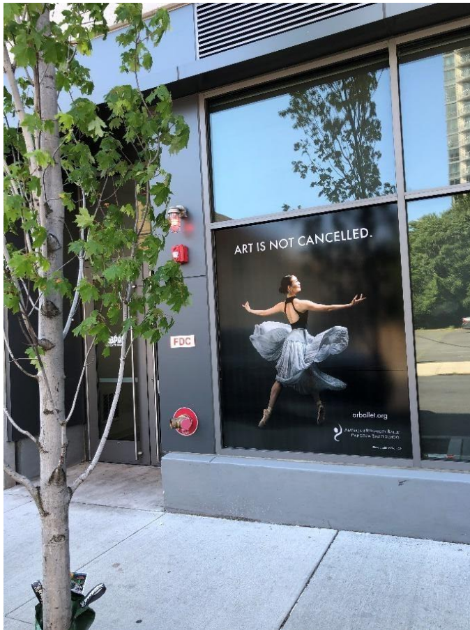
The main entrance to Princeton Ballet School's New Brunswick location at 60 Bayard Street, at the New Brunswick Performing Arts Center.

Students should arrive wearing their dance attire.