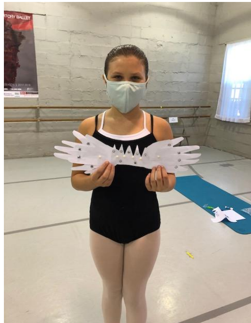
A PBS student in the Junior Summer Intensive program, Cranbury studio, July 2020.