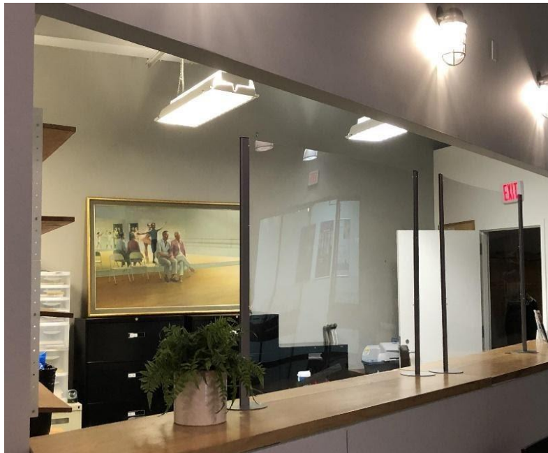
Plexiglass shields have been installed at each front desk location.

While Princeton Ballet School will not be able to fully eliminate risk due to COVID-19, we aim to keep students, families, and our employees as safe as possible as they return to the studio. We will continue to evaluate our processes, adapt as needed, and want to emphasize the shared responsibility of our community as we reopen safely.