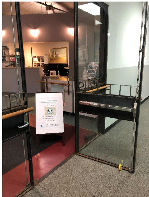
Entrance to Princeton studios, with a sign indicating employees and students only.