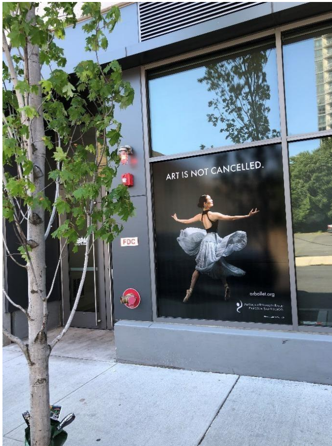
The main entrance to Princeton Ballet School's New Brunswick location at 60 Bayard Street, at the New Brunswick Performing Arts Center.

Students should arrive wearing their dance attire.